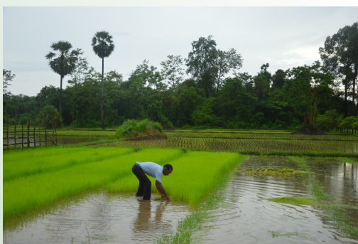
Rice nursery in Preah Vihear province

Another issue is the shift from a practice based on nursery and transplanting to direct seeding. This change is driven by both climate change (drought, late rain...) and by a lack of labour force. It is leading to higher competition with weeds. This may lead some farmers to step back from the organic scheme, or lead to an increase use of herbicide by conventional farmers around, hence an increased risk of contamination of organic plots.