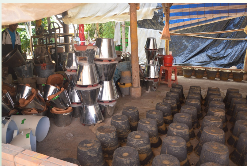
Cook stove workshop