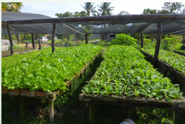
Vegetable production at ECOFARM