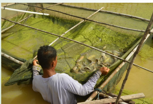
Fish production around Siem Reap

Farmers deal with a range of issues when it comes to fish selling. The lack of networking is among the most constraining. Farmers with social and marketing skills are able to easily sell their fish at a good price to other villagers. Selling to middlemen offers the opportunity to sell bigger quantities at one time but comes up against other challenges. Farmers are not well linked to intermediaries. Moreover, they cannot meet quality demand from middlemen. Thus, these buyers are in a dominant position to impose lower prices. At a national level, fish price is maintained low by imports from neighbouring countries, particularly Vietnam.