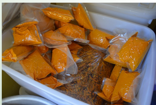
Tumeric power produced by a GF's processing group

Also due to the lack of communication between the actors of the supply chain, little is known by the farmers about the quality requirement of the local professional demand. It is reinforced because of the low level of literacy of many farmers. Finally, the main constraints are: i) flooding of numerous vegetable production lands in the rainy season and competition with rice farming activity (labor, and cash necessary for purchasing inputs), ii) lack of water in the dry season to further develop production, iii) lack of financial capacity to make investments, lack of technical skills to develop new productions, lack of feedback on demand.